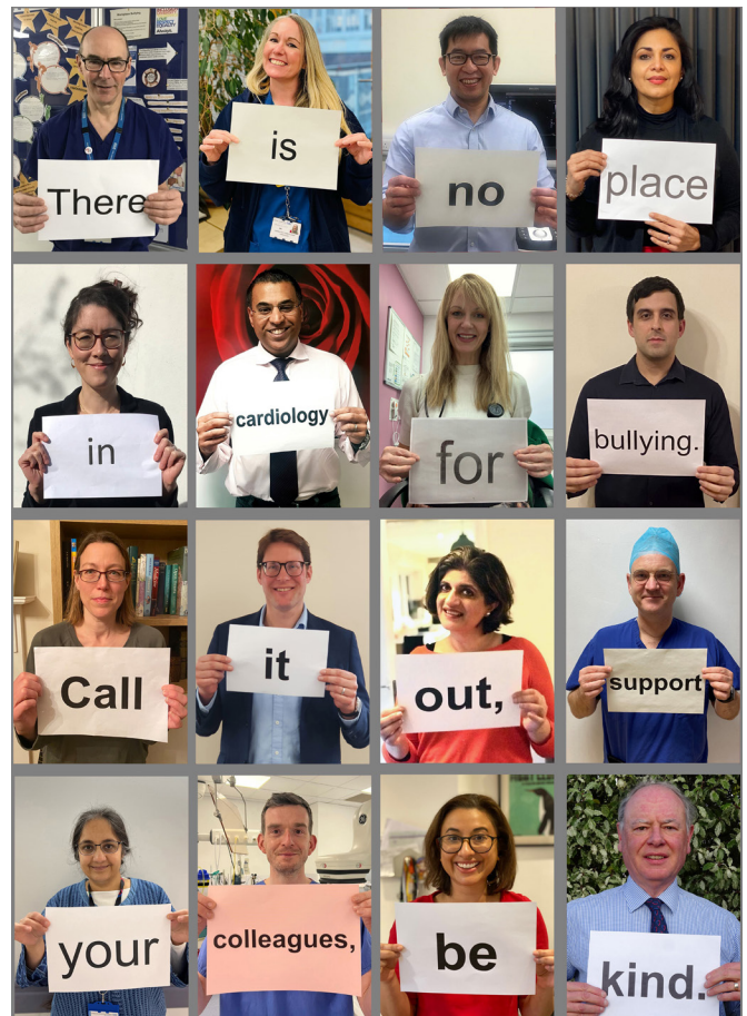
Figure 1 Promoting workplace culture and awareness through a British Cardiovascular Society anti-bullying campaign.

Evidence to suggest individuals may cynically attempt to manipulate such systems is limited. 4 While deliberately raising a false allegation is never acceptable, in the absence of additional evidence, those raising a concern must be treated from the outset as though the allegation is genuine and the department's standard policy for dealing with such reports should be followed.