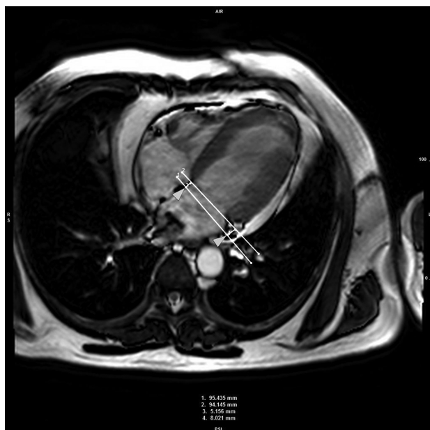
Abstract 16 Figure 1 MAPSE measurements were taken in the four-chamber cine.