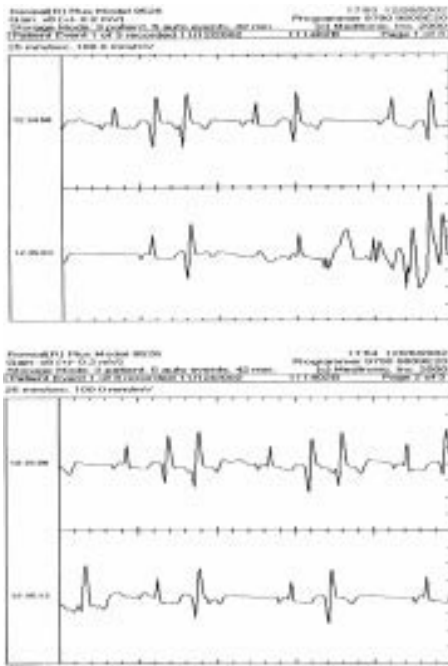
Figure 3 Recording from an externally applied insertable loop recorder in an ambulatory patient complaining of palpitations.

ambulatory ECG products were used in this patient for Holter monitoring and continuous loop event recorder monitoring, during which time the patient failed to record a symptomatic arrhythmic event. The patient found the ambulatory ECG monitors cumbersome and refused further monitoring with these devices. He was offered an ILR but refused on the basis of the required procedural invasiveness. He agreed to undergo application of an externally applied ILR.