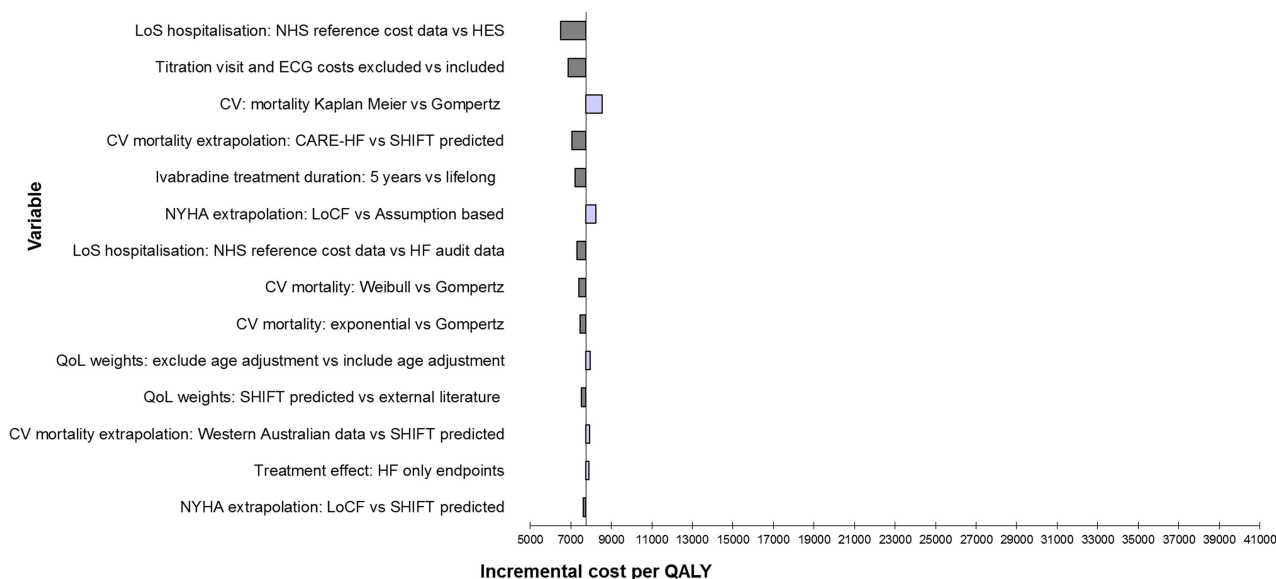
Figure 1 One way sensitivity analyses for patients with heart failure (HF), heart rate \geq 75 bpm (£).

expected to reduce mortality and hospitalisations in such patients relative to standard care.