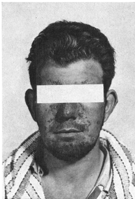
FIG. 2.—Typical rash of adenoma sebaceum.

The patient improved despite his persistent arrhythmia and was discharged, whereupon he returned immediately to Ireland. He was seen at the hospital on one occasion 6 months later and felt well, though his pulse remained irregular and the cardiogram still showed multifocal extrasystoles and left bundle-branch block. As far as is known, he has resumed his normal work as a labourer.