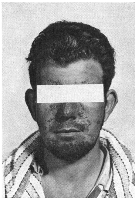
FIG. 2.—Typical rash of adenoma sebaceum.

The patient improved despite his persistent arrhythmia and was discharged, whereupon he returned immediately to Ireland. He was seen at the hospital on one occasion 6 months later and felt well, though his pulse remained irregular and the cardiogram still showed multifocal extrasystoles and left bundle-branch block. As far as is known, he has resumed his normal work as a labourer.