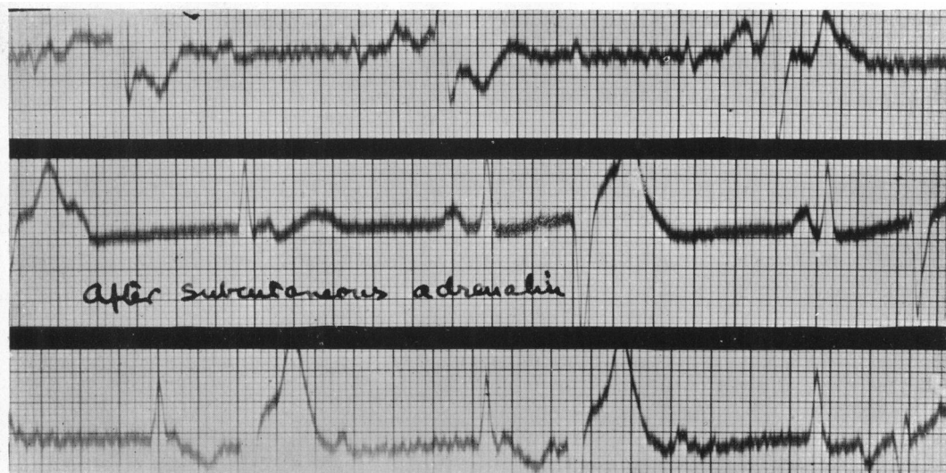
FIG. 2.—After subcutaneous injection of adrenalin showing frequent ventricular extrasystoles: auricular rate about 75; ventricular rate about 48 when no extrasystoles.

to 60. It is not influenced by subcutaneous injection of 1/100 of a grain of atropine sulphate. Ventricular extrasystoles appear after exercise and after subcutaneous injection of adrenalin. These extrasystoles alternate with regular beats for 10 to 20 cycles at a time. X-ray screening shows slight enlargement of the left side of the heart. Clinically, the heart does not appear enlarged, with the apex beat three and a half inches from the midline. There are no murmurs. The blood pressure is 150/90. The pulse is dicrotic. The cardiogram shows complete dissociation of auricle and ventricle, but otherwise is normal except for the appearance of the ventricular extrasystoles. These are not present when she is at rest. There is a complete absence of all tendon jerks throughout the body.