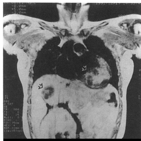
Figure 2 Magnetic resonance imaging of thorax and abdomen showing two hydatid cysts, one in the left ventricle and another in the liver (arrows).

Interesting aspects of this case are the unusual site, 1 young age of the patient, and the successful removal of the intact cyst. The most dangerous complication of cardiac hydatid cysts is early rupture, which can induce embolism or lifethreatening anaphy-