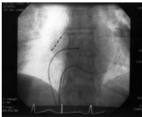
Figure 1 Anteroposterior radiograph showing positions of the multipolar electrode in the coronary sinus and quadripolar electrodes in the right atrial appendage and on the atrial septum.

atrial appendage, coronary sinus os, atrial septum, and simultaneously to the coronary sinus os and right atrial appendage. To ensure effective dual site pacing, the poles of the atrial appendage lead and then the coronary sinus os lead were in turn briefly disconnected to make certain that atrial pacing continued through the lead which remained connected. In the 17 patients in whom an Amplatz shape catheter was introduced into the coronary sinus, the os was identified by injection of contrast medium. In the patients undergoing ablation for atrial flutter, the tip of the duodecapolar electrode was advanced to the distal coronary sinus after successful isthmus ablation.