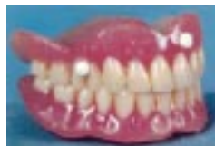
See p 209