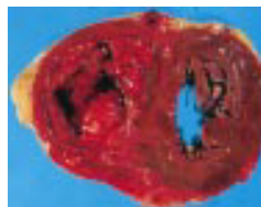
See p 328