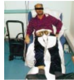
See p 469