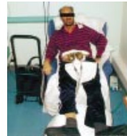
See p 469