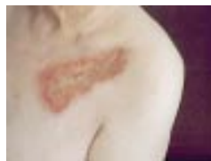
See p 414