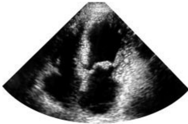
Figure 2 Ten years after surgery, echocardiography shows no evidence of infiltration.

Postoperatively, she received corticosteroids, warfarin, azathioprine, aspirin, and dipyridamole. Progress was slow but the heart failure, visual impairment, and neuropathy resolved. It was possible to simplify the regimen to warfarin and prednisolone, the dose averaging about 5 mg daily and being adjusted carefully to maintain a normal blood eosinophil count. She has continued to require inhaled asthma medication. She remains in good health at 10 years after surgery and the echocardiogram is now normal (fig 2).