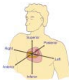
See p 503