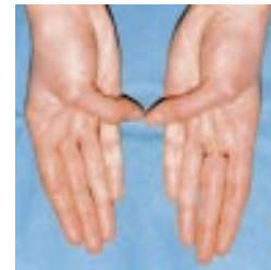
See p 97