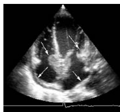
See p 1282