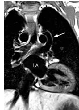
See page 1444