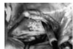
See p 341