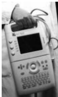
See p 727