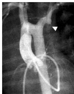
See page 245