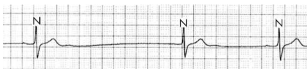
Figure 4 Sinus pause during episode of apnoea in an OSA patient.

Sudden infant death syndrome (SIDS) is marked by unexpected sudden death in infants up to six months of age, usually during sleep. The primary cause of SIDS has long been a source of debate, with a multifactorial postulate relating to the pulmonary or cardiovascular systems, possibly caused by failure of neural control. The abrupt nature of death points toward an arrhythmic mechanism. Recent evidence suggests that QT interval prolongation during the first week of life is a significant risk factor for SIDS. 18 The odds ratio determined by this study (41) was, in fact, higher than those of the traditional risk factors of sleeping in the prone position, maternal smoking, and bed sharing. The