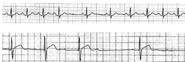
Figure 1 Typical arrhythmias demonstrated in a healthy male during sleep. Upper panel: pronounced sinus arrhythmia. Lower panel: type 1 second degree atrioventricular block (Wenckebach).

REM sleep occurs approximately 4–6 times per night for 90 minute periods, characterised by surges of sympathetic activity and decreased baroreceptor regulation and control. 10 The highest incidence of non-fatal myocardial infarction, implanted defibrillator discharges, and sudden cardiac death occurs in a non-uniform manner throughout the night. 10 A surge in each of these events occurs between 5 and 6 am, coinciding with an increased incidence of REM sleep. Several mechanisms are likely involved in this phenomenon, including diminished myocardial perfusion and increased electrical instability caused by high sympathetic tone, as well as a