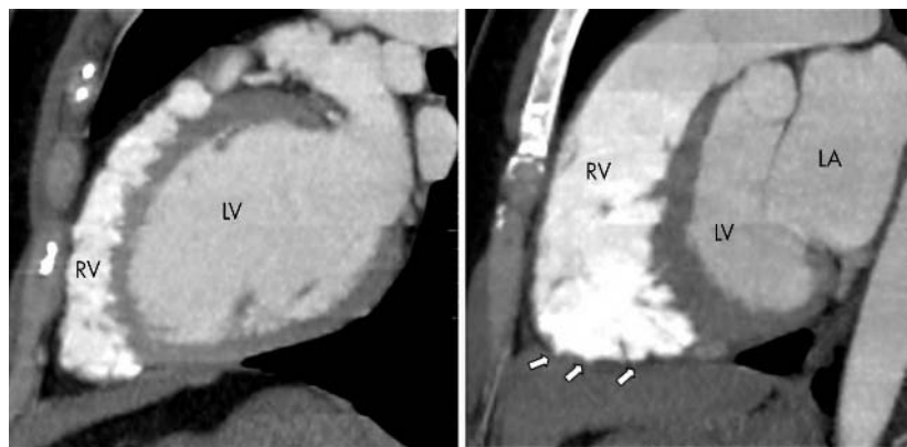
Left: Reformatted image in short axis scan showing enlarged myocardial trabeculae. Right: Reformatted image in short axis scan show bulging of the inferior wall (arrows), which is compatible with aneurysm formation and is pathognomonic for ARVC. LA, left atrium; LV, left ventricle; RV, right ventricle.

P Robles P Olmedilla J J Jimenez probles@thalcorcon.es