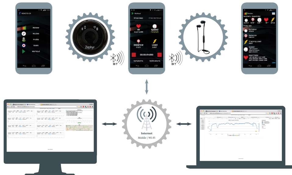
Figure 1 Remotely monitored exercise-based cardiac telerehabilitation platform schematic.